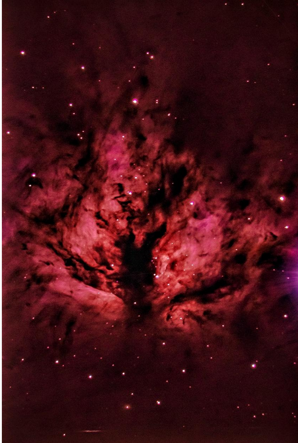
CCAS member Paul Wilson took this photo of NGC2024 (The Flame Nebula). Located in the constellation Orion, this emission nebula is approximately 1,350 light years from Earth. (Shot using Celestron CPC 1100 Edge HD with .7 focal reducer, Canon 800D modified with no filters at 400iso, 40 light frames at 180 seconds with dark and bias frames, no flats. An ASI AIR Pro was used for control of the camera, mount and scope and the photo was processed in Photoshop.)